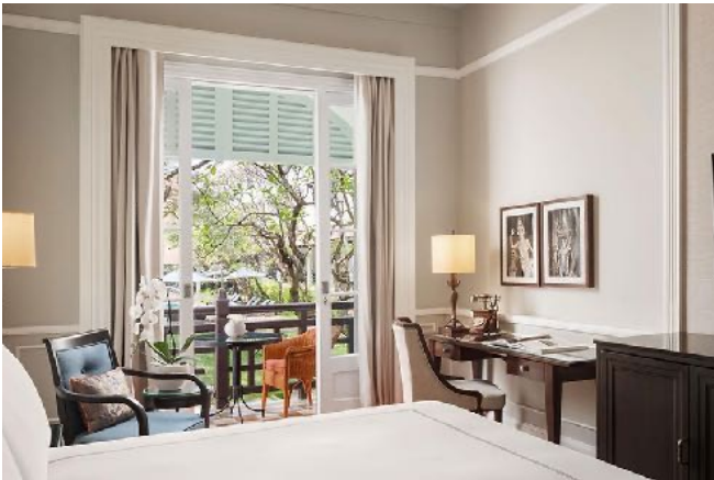
Raffles Hotel Le Royal State Room

We've carefully curated the beautiful accommodation on this wellness holiday to bring you comfort and style throughout your trip. Room upgrades can be arranged at all properties - ask us for a quote.