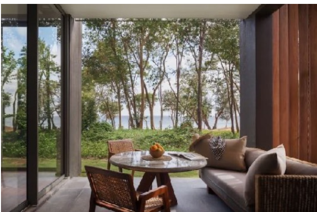
Koh Russey Resort Garden Pavilion

Treeline Urban Resort is a boutique design hotel with a contemporary art space, nestled on the riverside in Siem Reap.